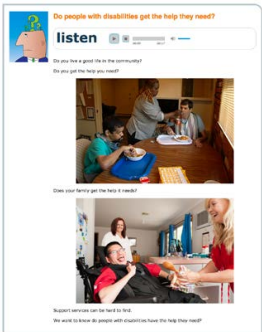
An example of one of the knowledge translations from “Knowledge for All”