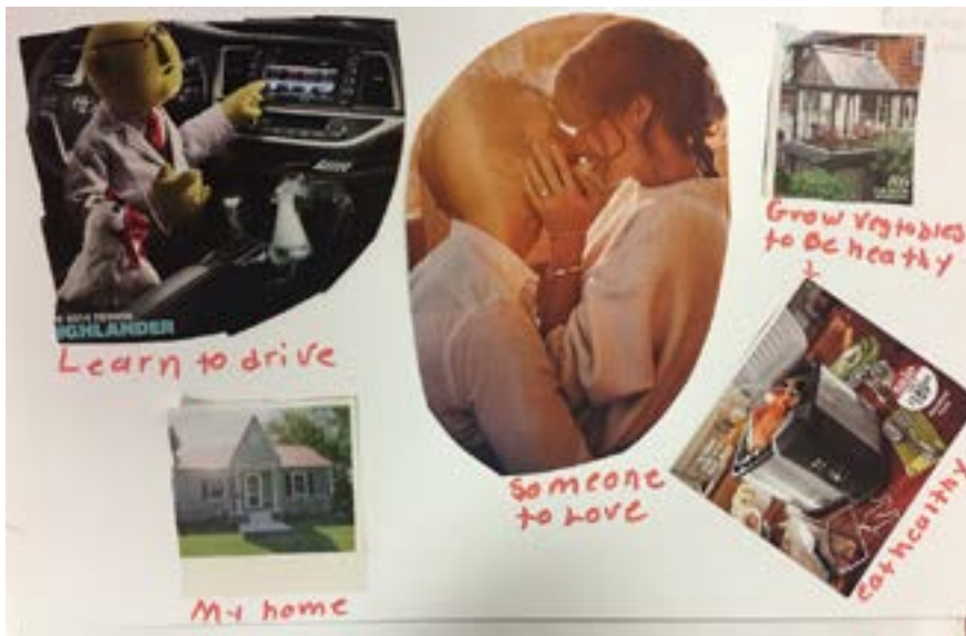
Examples of a dream boards