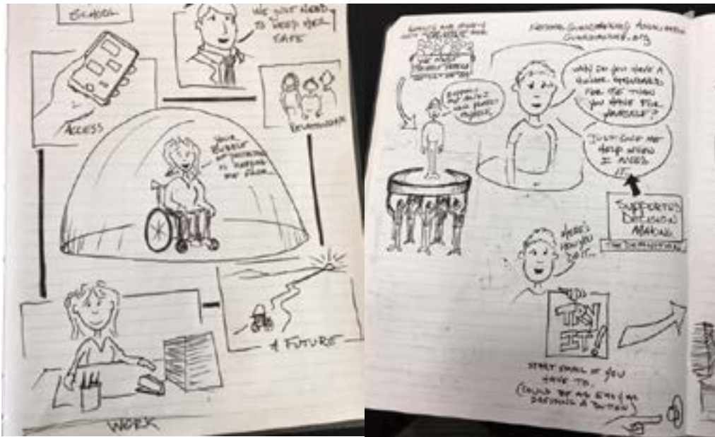
Supported Decision-Making balances self-determination and safety

agencies, Medicaid Waiver providers, and Centers for Independent Living all must provide education, employment, and independent living supports. DSPs interface with these providers regularly. Therefore, they can encourage people and providers to work together to create a CCS where —